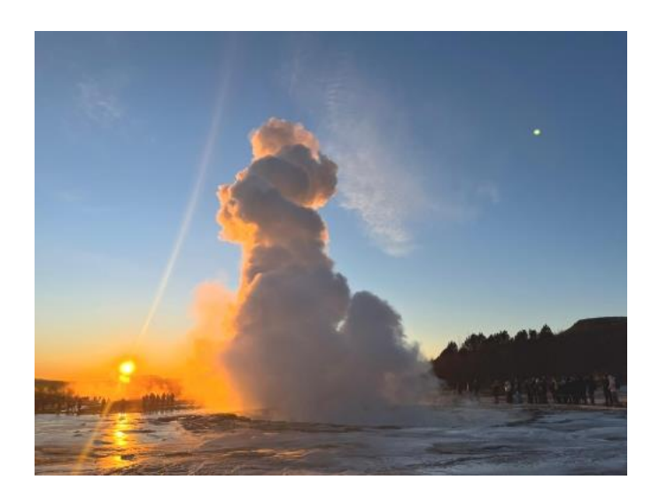
Geothermal activity at Geysir

After a light lunch it is time to say goodbye to the horses and your hosts as you leave to visit the Golden Circle, the three most impressive natural sights in South Iceland: Geysir geothermal area, the golden waterfall Gullfoss and Thingvellir National Park.