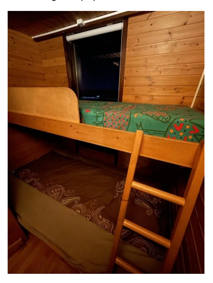
Bunks in the guest cabin at Kálfhóll

Northern Lights display over Kálfhóll cabin